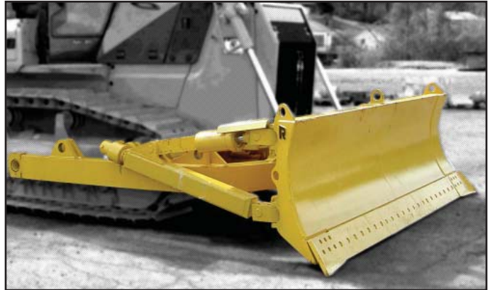
Heavy-duty angle blade, c-frame, and brace group.

To find out more about Rockland Angle Blades, c-frames, and brace groups, or to discuss your specific application, please call us at 800-458-3773.