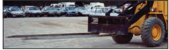
Car Body Forks With Optional Longer Tines

Rockland CBF Car Body Forks are tough and they won't take a bite out of your pocketbook or the maintenance budget. The entire unit is built of tough, weight-saving, alloy steels that deliver years of dependable service. The solid frame also does double duty as a dozer to keep yards level, fill low spots, or keep scrap out of the way. If you handle crushed cars with a loader, specify Rockland CBF Car Body Forks.