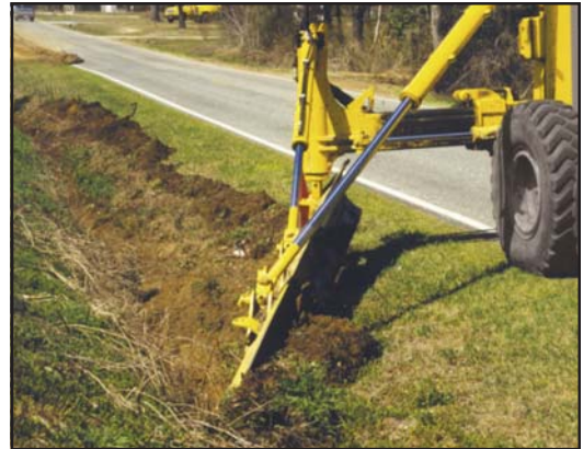
U.S. Patent No. 5,542,478 Specifications subject to change without notice.