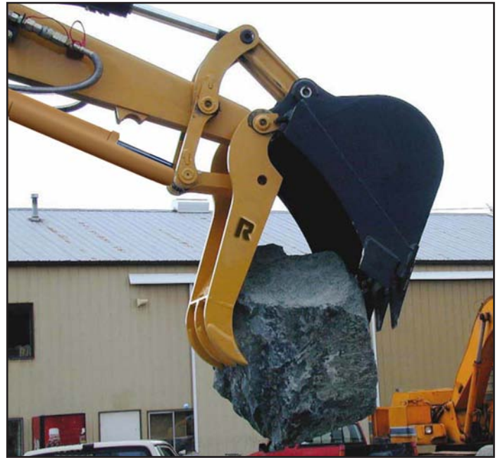
Easily handle bulky material.