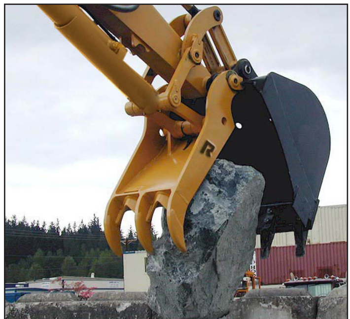
Precisely pick and place material.