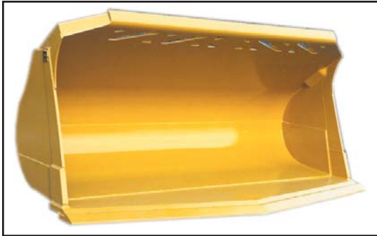
HD-V SPADE NOSE