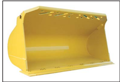
HD-S STRAIGHT EDGE

Rock handling demands a special bucket. Rockland has been building rock buckets for over forty years. Put our years of experience to work for you.