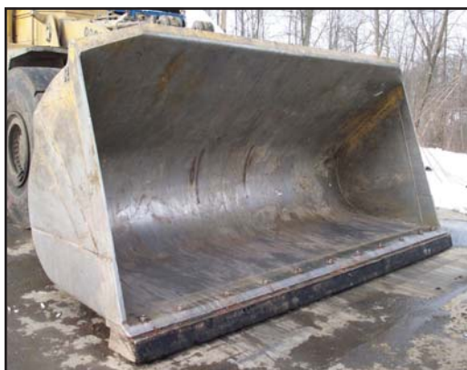
(Shown without spillguard)

Cutting Edge Options - Set up your TH Bucket specifically for your operation. Bolt-on rubber edges or your favorite reversible bolt-on edges are available.