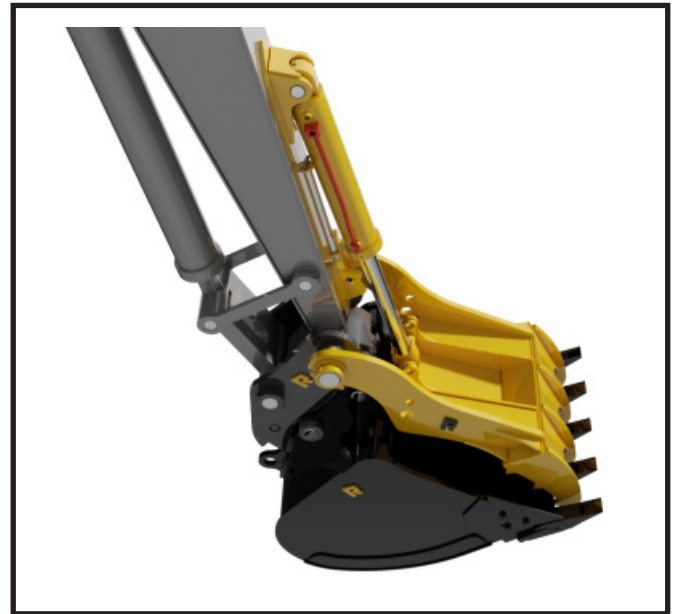
WHP Pin Mounted Hydraulic Thumb